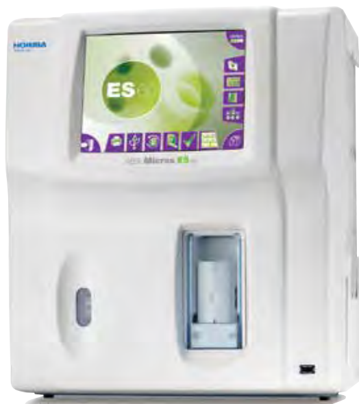
Closed tube version

A new generation hematology analyzer based on the Micros concept, universally recognized for its reliability, robustness and high quality results